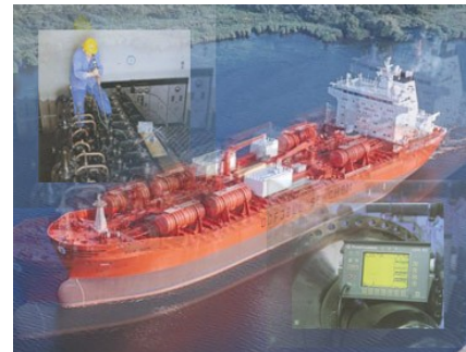
NDT services across all sectors

As a result of their involvement in the project and its uptake of digital radiography technology, the company has secured 200,000€ of sales with anticipated future contracts worth a further 300,000€. Moreover, one new job has been created to support this growth with an estimated three to follow.